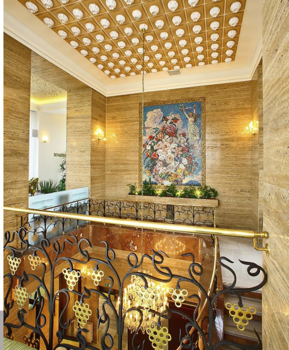
WEDDINGS MEETINGS COCTAILS