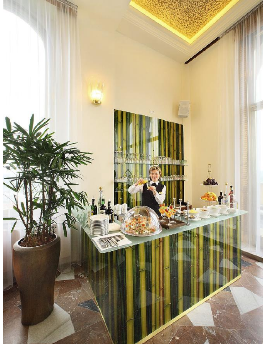
LEGENDARY TOWER WITH BALCONIES